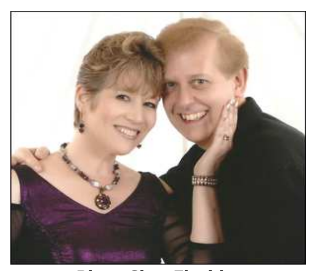
Plant City, Florida